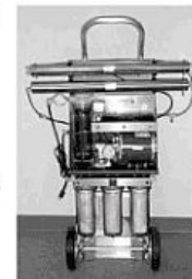
Portable 400 GPD with tank for onsite demonstration.