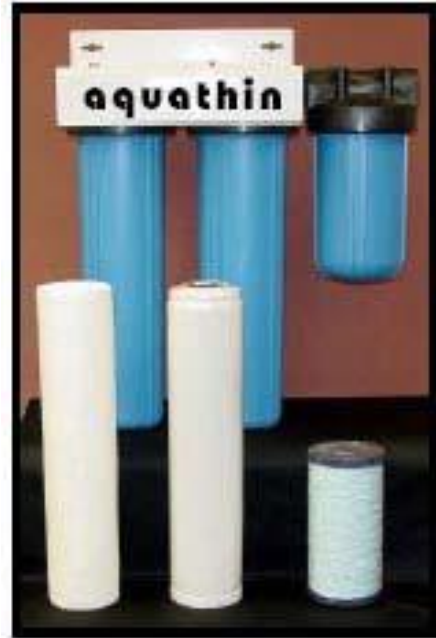
MODEL: ASTF 3000 Series